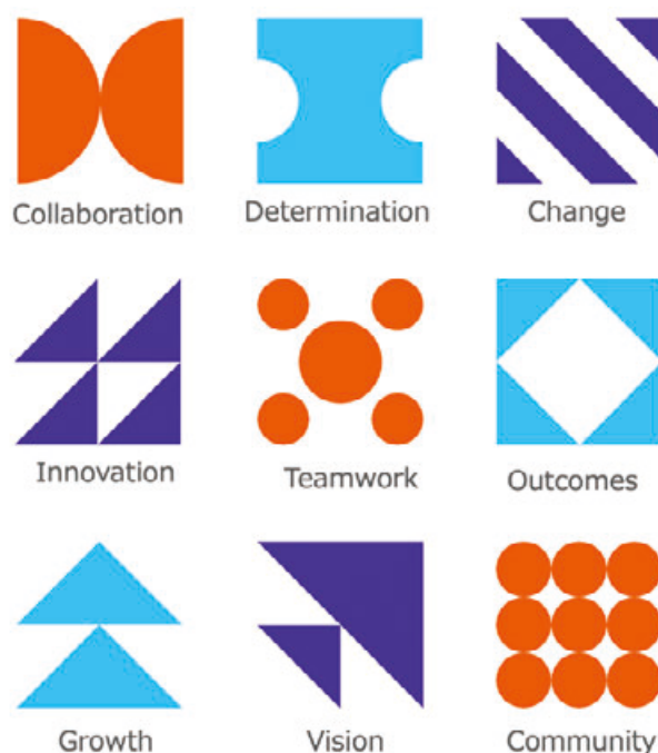
Visual identity of the new PMI brand logo

A new brand logo for the next 50 years was released at the North American Global Conference in 2019. The new PMI brand logo consists of nine visual identities, and each of them has both the history of PMI and the qualities needed to drive the future of the project economy. The year 2020 marks the first year for PMI to start the next 50 years. In addition to promoting the project economy, PMI aims to implement activities to instill project management™ in every generation as a life skill.