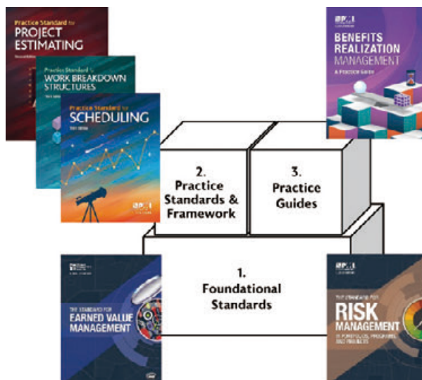
Three types of standards

PMI develops and publishes a variety of standards. There are three types of standards: "Foundational Standards," "Practice Standards & Framework," and "Practice Guides."