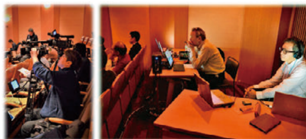
Operation for Streaming Service