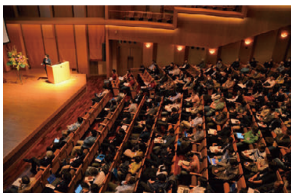
The Lecture Hall

The Festa provided live online streaming service to engage more people, regardless of where they live. In total, more