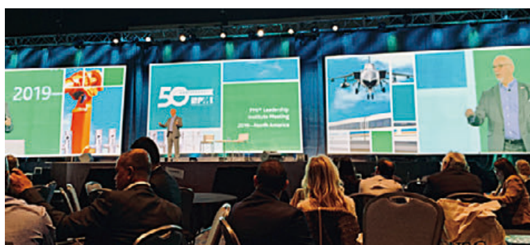
Opening of Global Conference 2019 in North America

The PMI Japan Chapter will continue to provide feedback on the latest trends that will be revealed at global congresses and will strive to further invigorate the PMI Japan Chapter's activities by incorporating the gained knowledge.